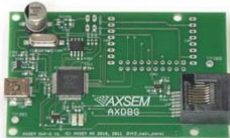
Figure 1. DVK Debug Adapter

not strictly required. The customer circuit may either be powered from the debug adapter (provided it requires less than 50 mA), or be powered by customer circuitry. In the latter case, customer circuitry must ensure that the device is powered during the entire programming process.