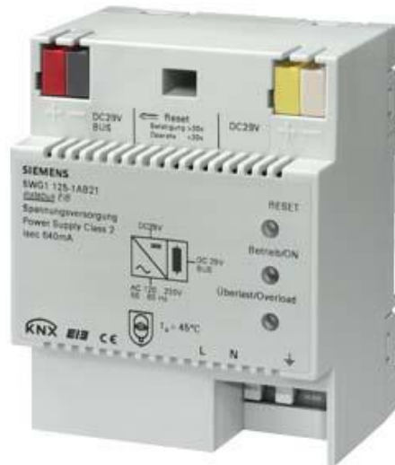
Figure 1 – KNX Power Supply

Note that using a normal bench power supply is not possible.