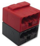
Figure 3 – KNX connector

The power supply is connected to connector J4 of the DUT. This connection can be done using a cable with official KNX connectors (Wago 243-211, farnell: 4016014).