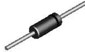
AXIAL LEAD (DO-35) CASE 017AG

Sourced from Process 1M. See MMBD1501 –1505 for characteristics.