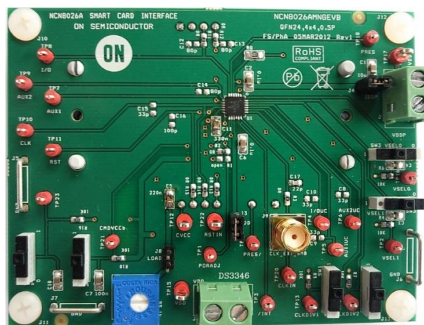
Figure 1. Evaluation Board

This document has to be used with the NCN8026A datasheet. The datasheet contains full technical details regarding the NCN8026A specifications and operation. The board (FR4 material) is implemented in two metal layers. The top and bottom layers have thicknesses of 35 \mu\text{m} . The PCB thickness is 1.6 mm with dimensions of 89 mm by 68 mm (see Figure 1).