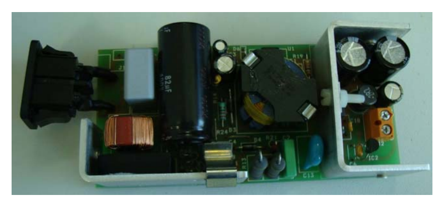
Figure 2. The PCB layout and component arrangement offers a compact size.