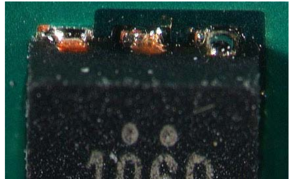
Figure 2: Exposed copper on package edge, with solder wetting after reflow, from singulation process.

designed to allow for tolerances in PWB fabrication and pick and place, which are necessary for proper solder fillet formation. MLP packages, when the pre-plated lead-frame is sawn, show bare copper on the end of the exposed edge leads. This is normal, and is addressed by IPC JEDEC J-STD-001C “Bottom Only Termination”. In practice it has been found that optimized PWB pad design and a robust solder process often yields solder fillets to the ends of the lead due to the cleaning action of the flux in the solder paste.