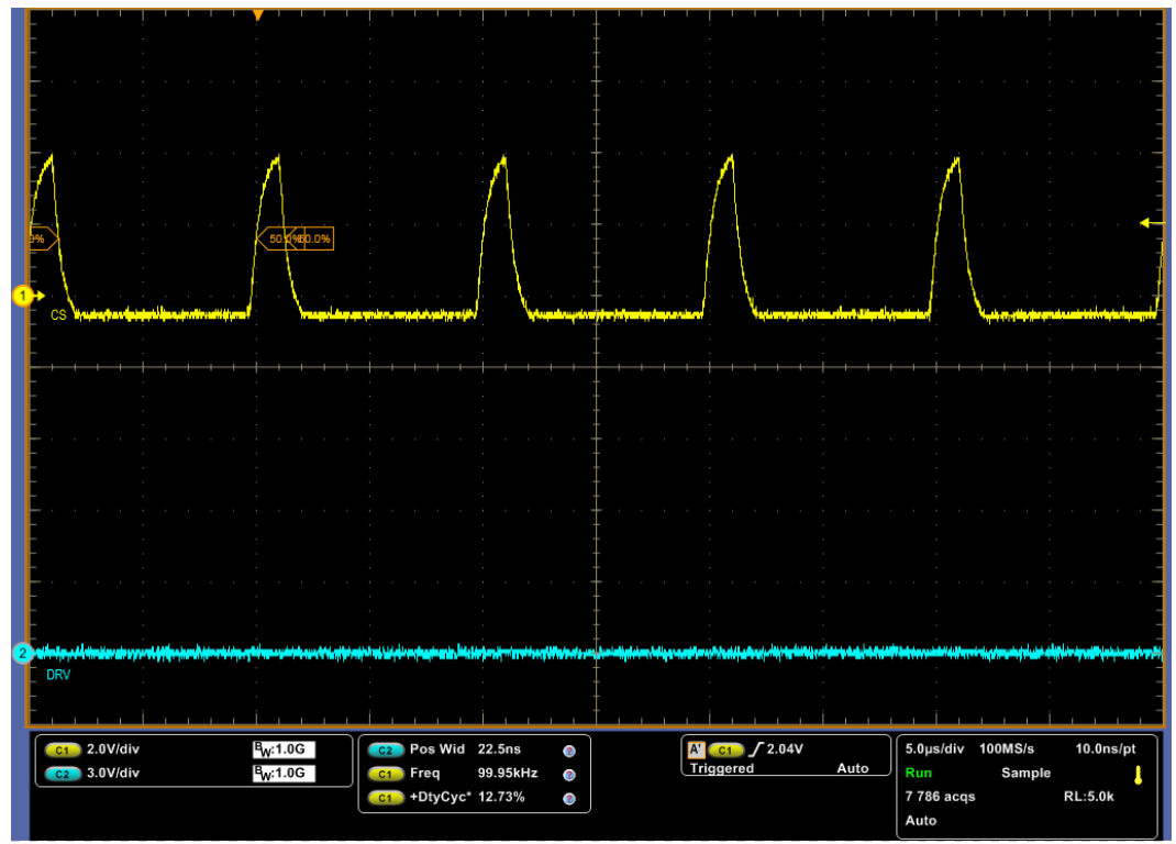
Figure 3: V_{CC} = 12 \text{ V} , f = 100 kHz, DC = 13%, V_{LOW} = -1 \text{ V} , V_{HIGH} = 4 \text{ V}