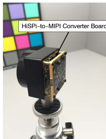
Figure 1. HiSPi-to-MIPI Converter Board Shown Connected to the X-Cube XGS 12000 Imager Board and Installed in the C-Mount Lens Housing