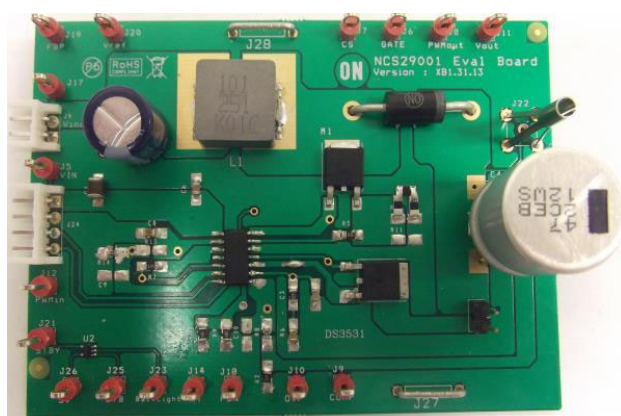
Figure 1. Evaluation Board (not to scale)

This evaluation board can be used to evaluate the device performance and it allows the user to place the NCS29001 device in a real application environment. While the intention is to evaluate the device according to datasheet specifications, it is important to take into account the additional circuitry inherent to the setup which can affect performance.