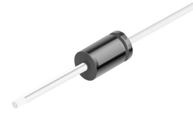
AXIAL LEAD (DO-35) CASE 017AG (Color Band Denotes Cathode)