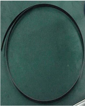
Black protective belt