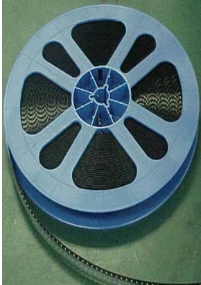
Reel with 3k units